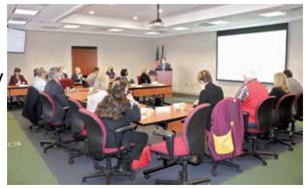
The county legislative delegation, county commissioners and school district superintendents discuss local youth mental health needs at a meeting I organized with the CCIU.

I was pleased to support the recent state budget, which included a substantial increase in spending for mental health programs including $100 million for schools, $100 million for adults and $15 million for county mental health services.